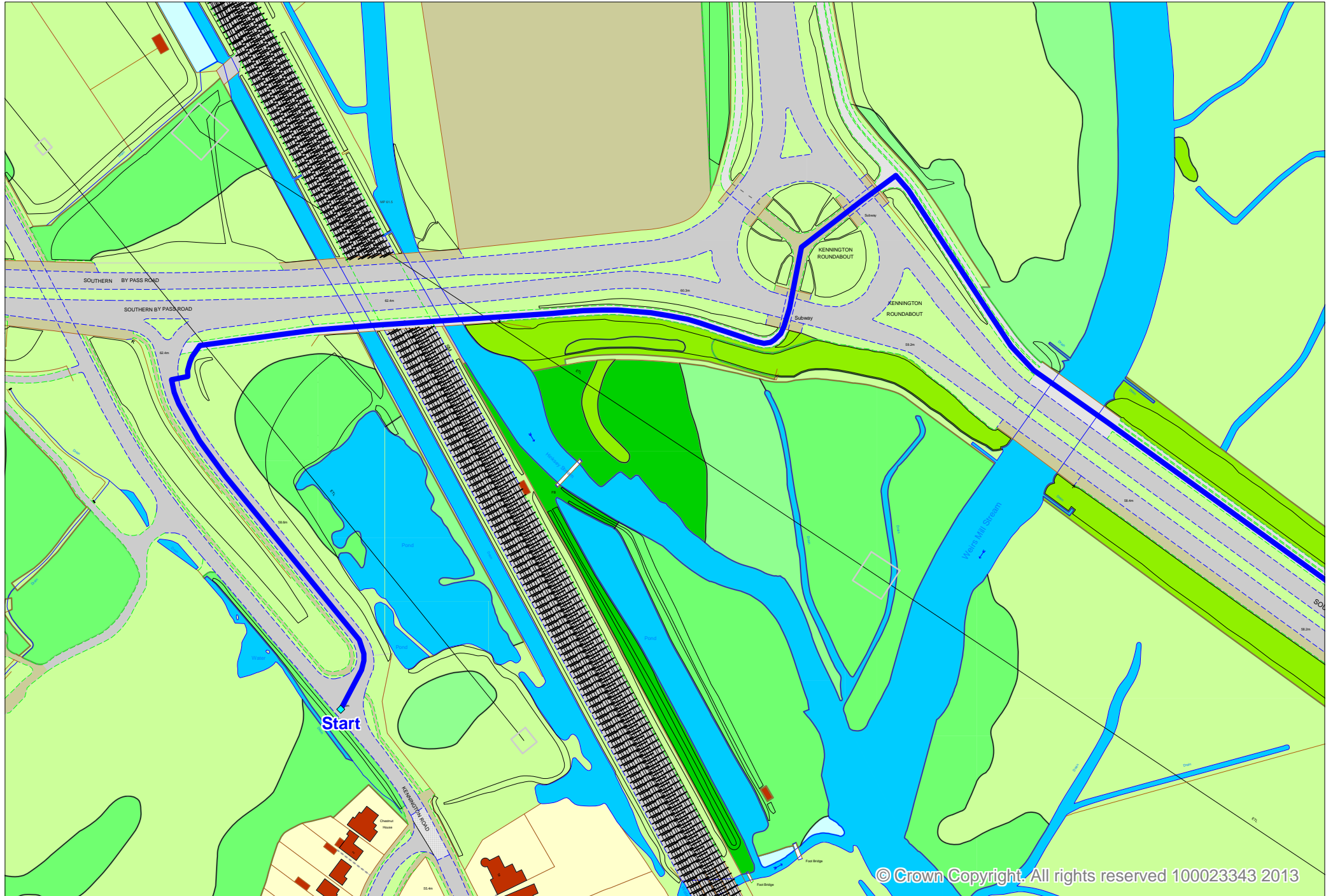
Map of route from Kennington to The Oxford Academy, Littlemore (from Kennington to Kennington roundabout)